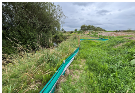
Silt Fence at Watercourse