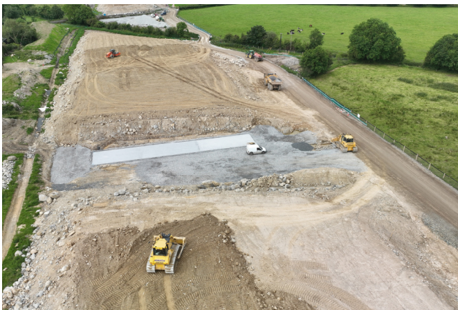
Underpass foundation and Earthworks