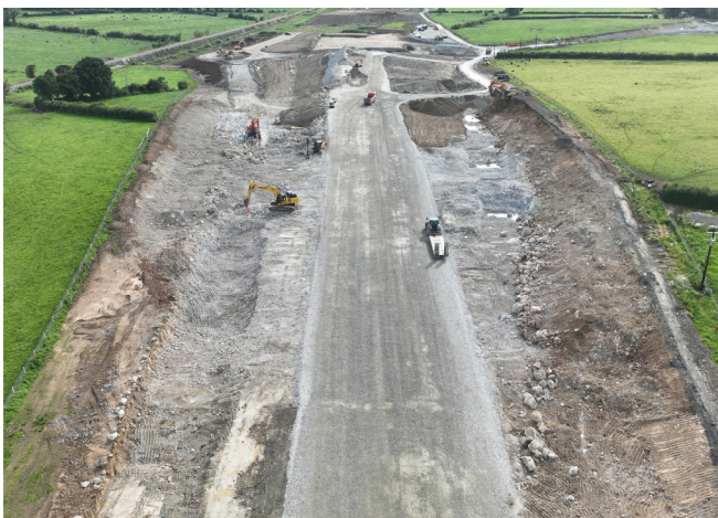
Earthworks Adare Junction