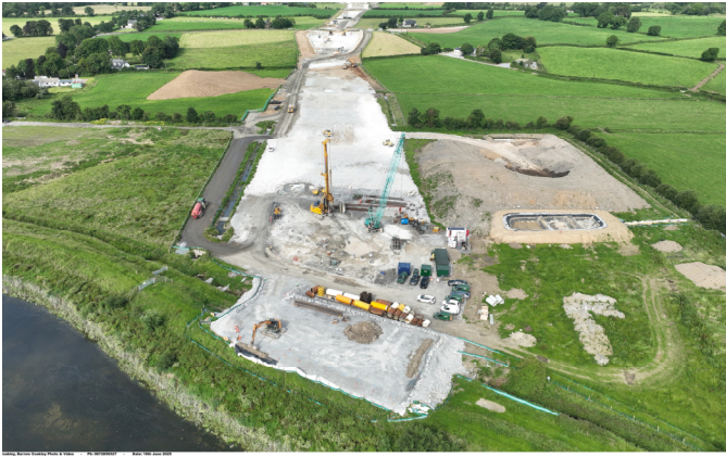
Piling at River Maigue