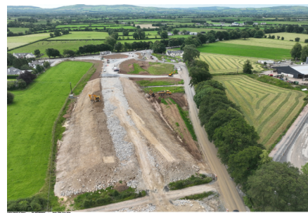
Croagh Link Road