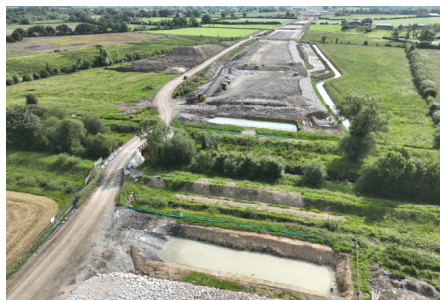
River Bridge Foundations