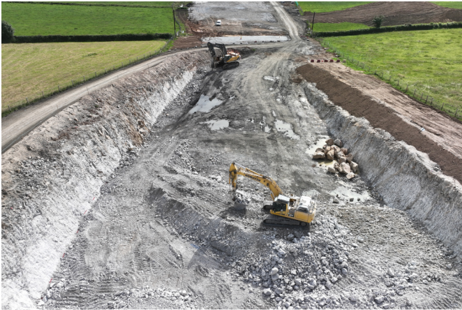
Rock Excavation at ch.60+400